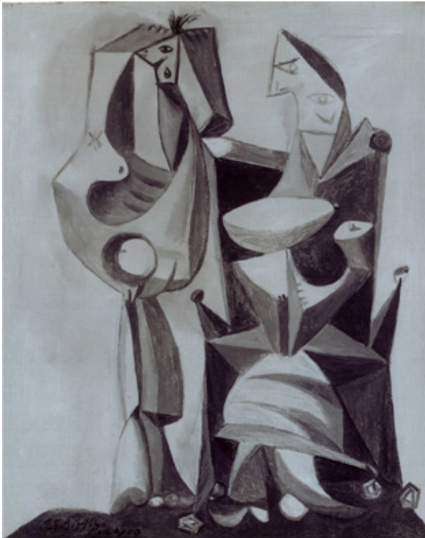
© 2011 Estate of Pablo Picasso / Artists Rights Society (ARS), New York.

Media Contact: Andrea Schwan, Andrea Schwan Inc. +1 917 371.5023 info@andreaschwan.com